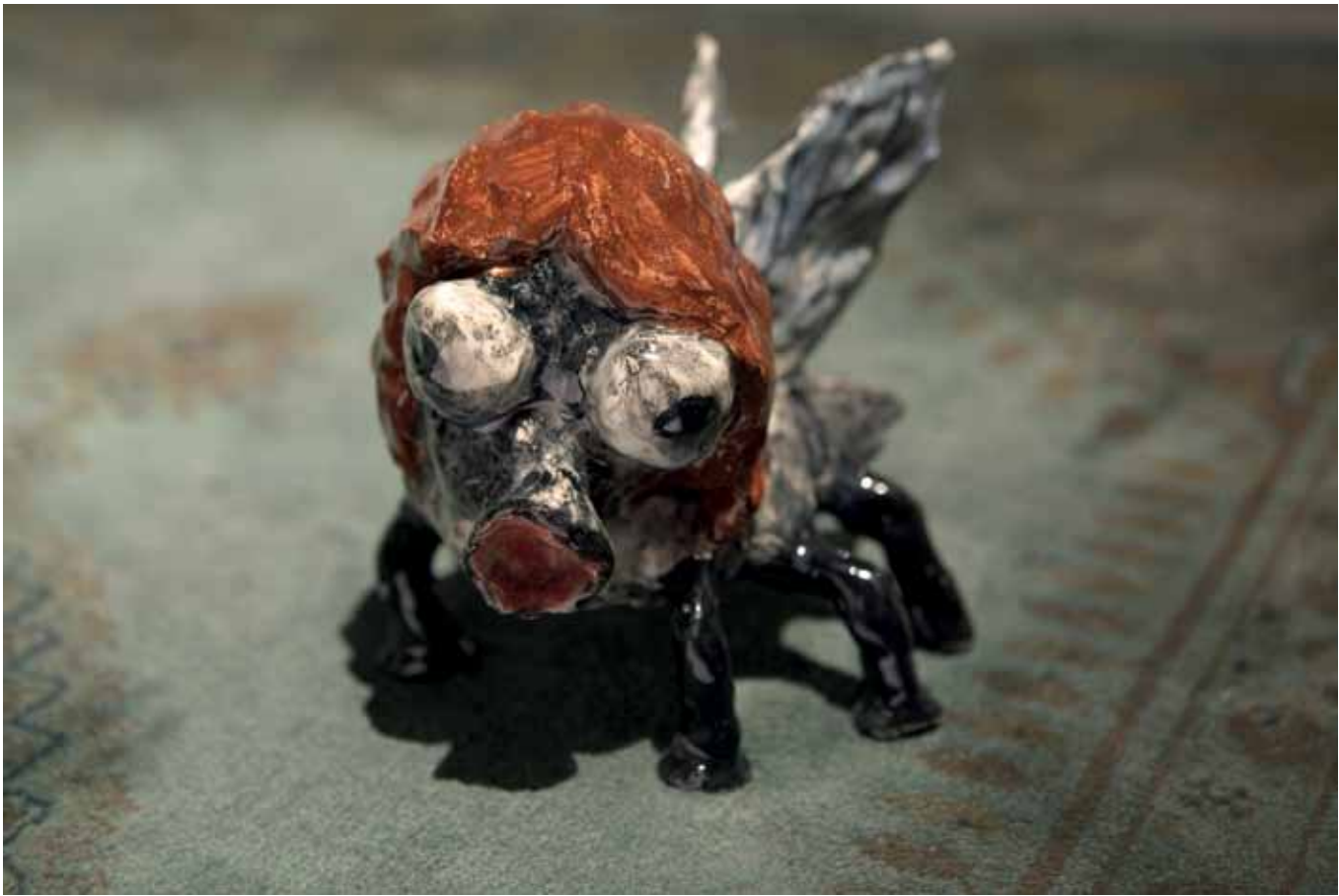
ABOVE Klara Kristalova A fly on your floor , 2010 glazed stoneware